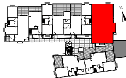
PLAN DE REPERAGE